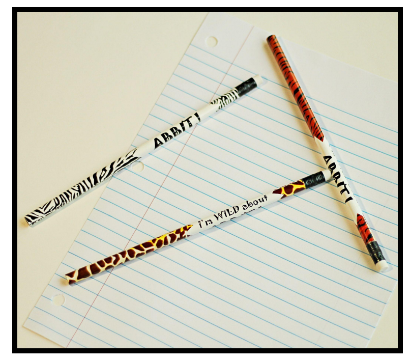
Wild About ABBIT (Safari)